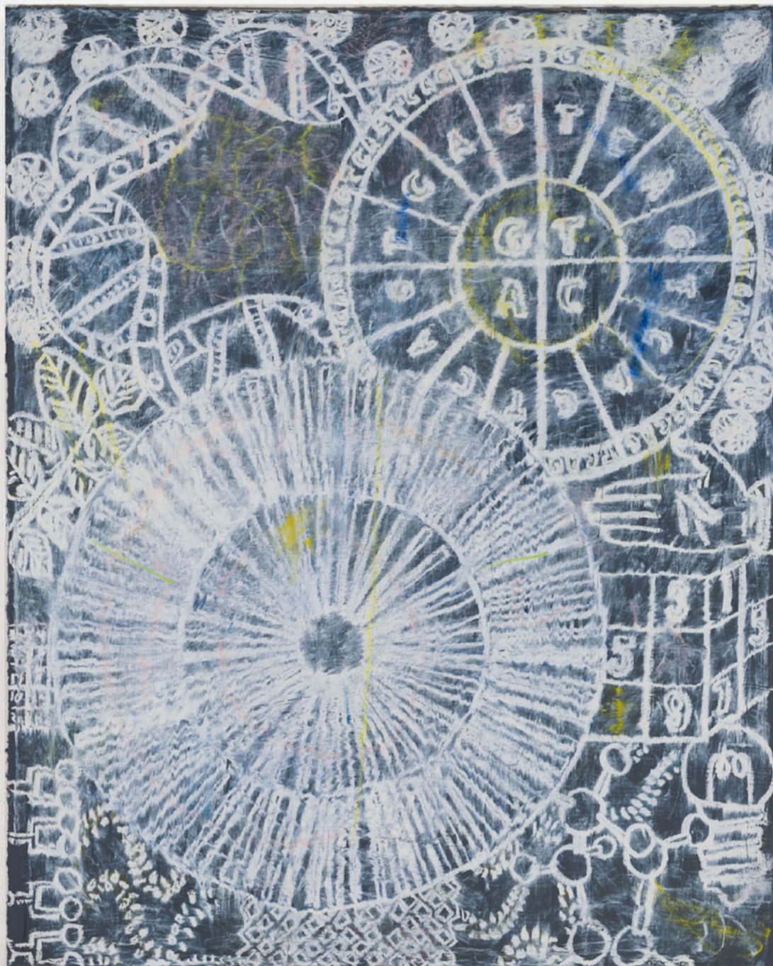
Philip Smith Untitled (Night Sky No. 19) , 2022 oil pastel on canvas 48" x 60"