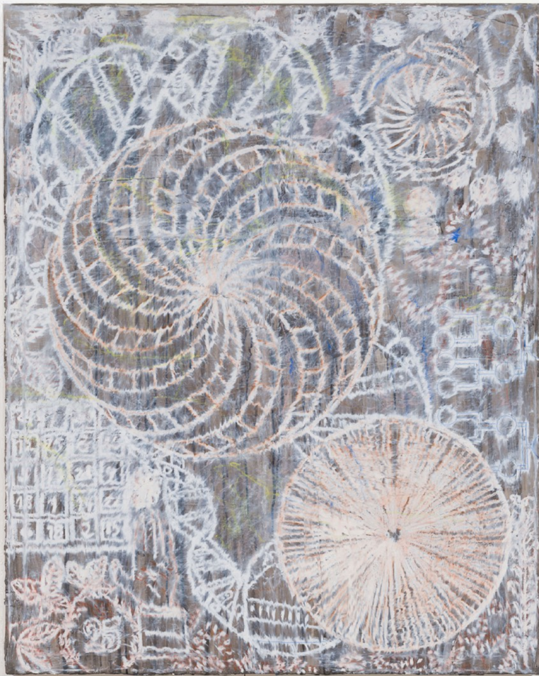
Philip Smith Untitled (Night Sky No. 25) , 2022 oil pastel on canvas 48" x 60"