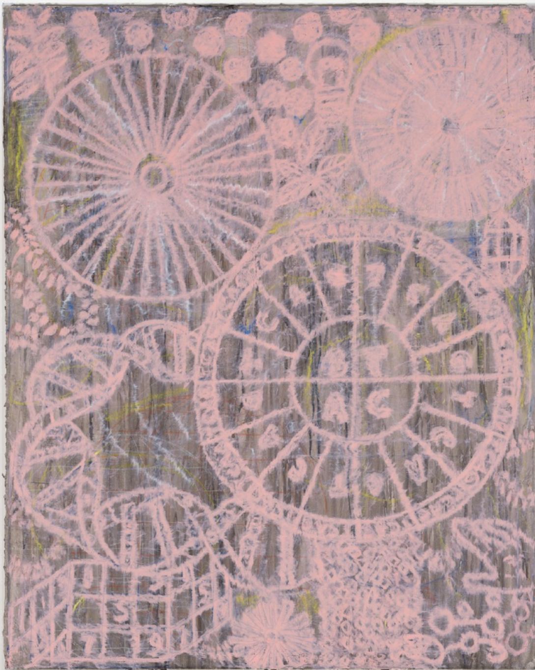
Philip Smith Untitled (Night Sky No. 23) , 2022 oil pastel on canvas 48" x 60"