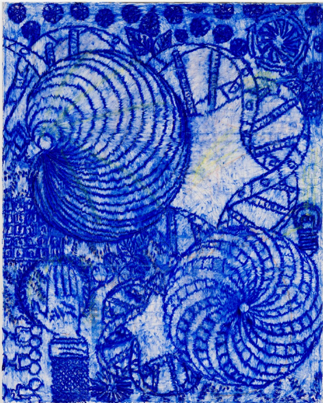
Philip Smith Untitled (Night Sky No. 24) , 2022 oil pastel on canvas 48" x 60"