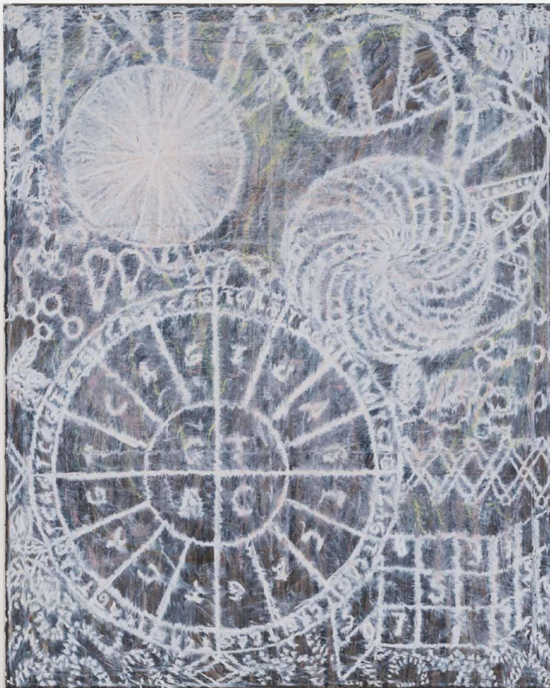
Philip Smith Untitled (Night Sky No. 21) , 2022 oil pastel on canvas 48" x 60"